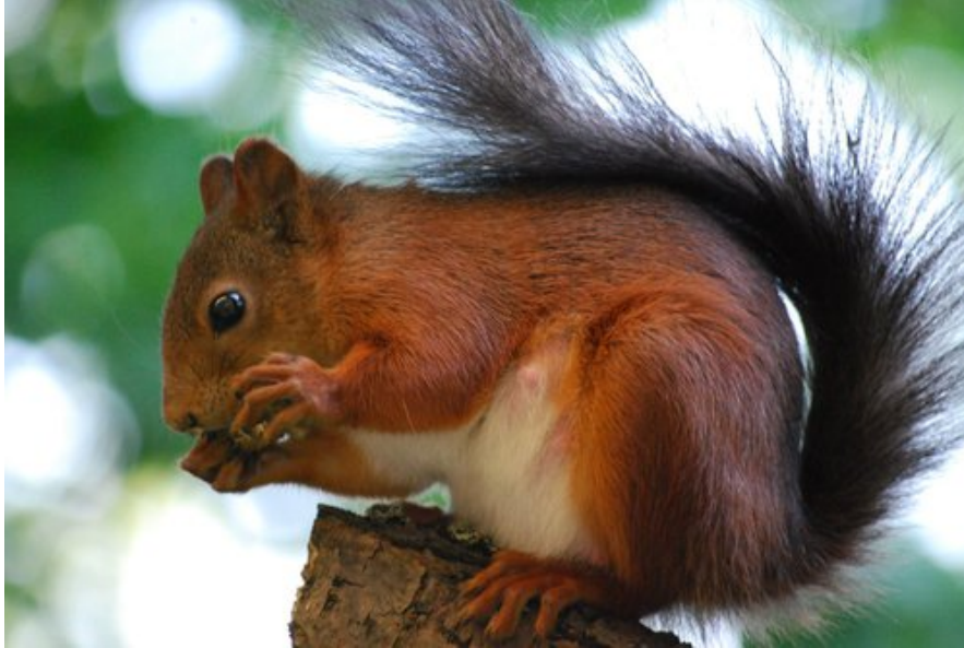
?figurename? 1.1: A long description of this squirrel figure.